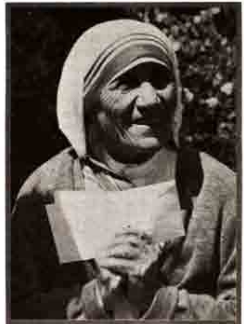
PATRONESS OF THE UNBORN AND THE VULNERABLE